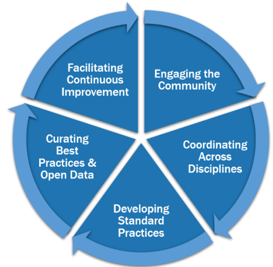
Figure 1: Pandemic Technology & GIS Preparedness Cycle